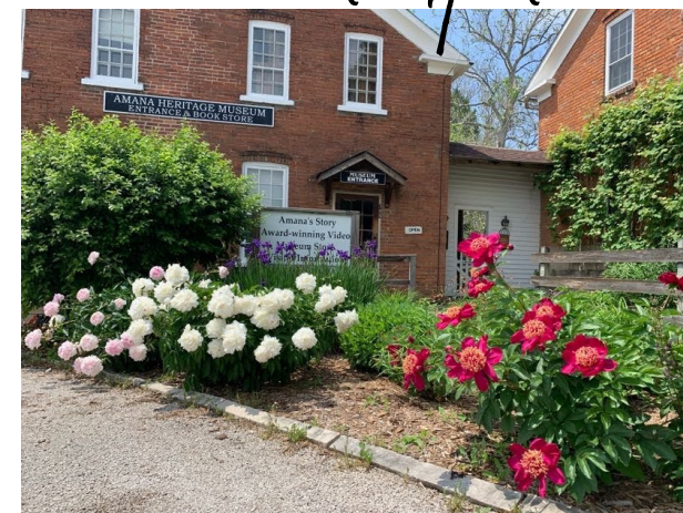
(Peach Plum, Prestele)